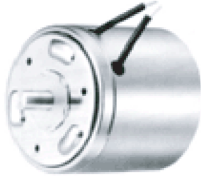
WEIGHT (ABD&R) : 3,056g

UNIT : \frac{\text{mm}}{\text{inch}} SHOWN DE-ENERGIZED, RIGHT HAND ROTATION